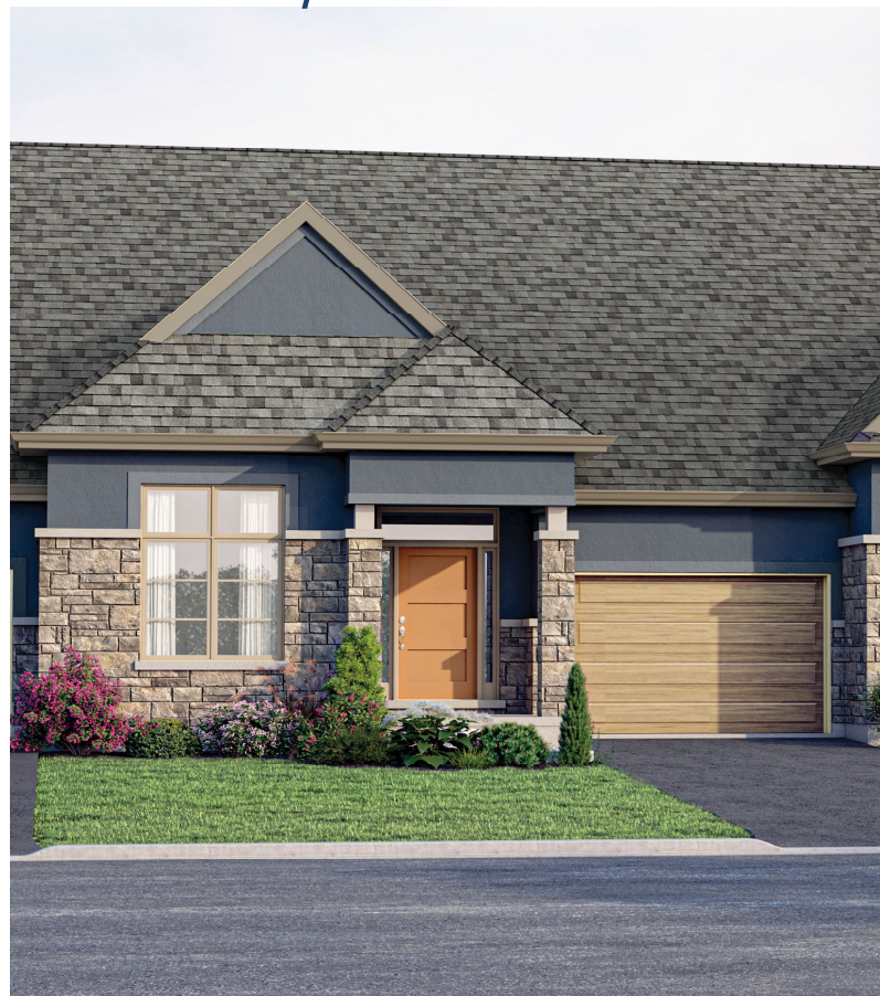
Architecturally Inspired Front Facade