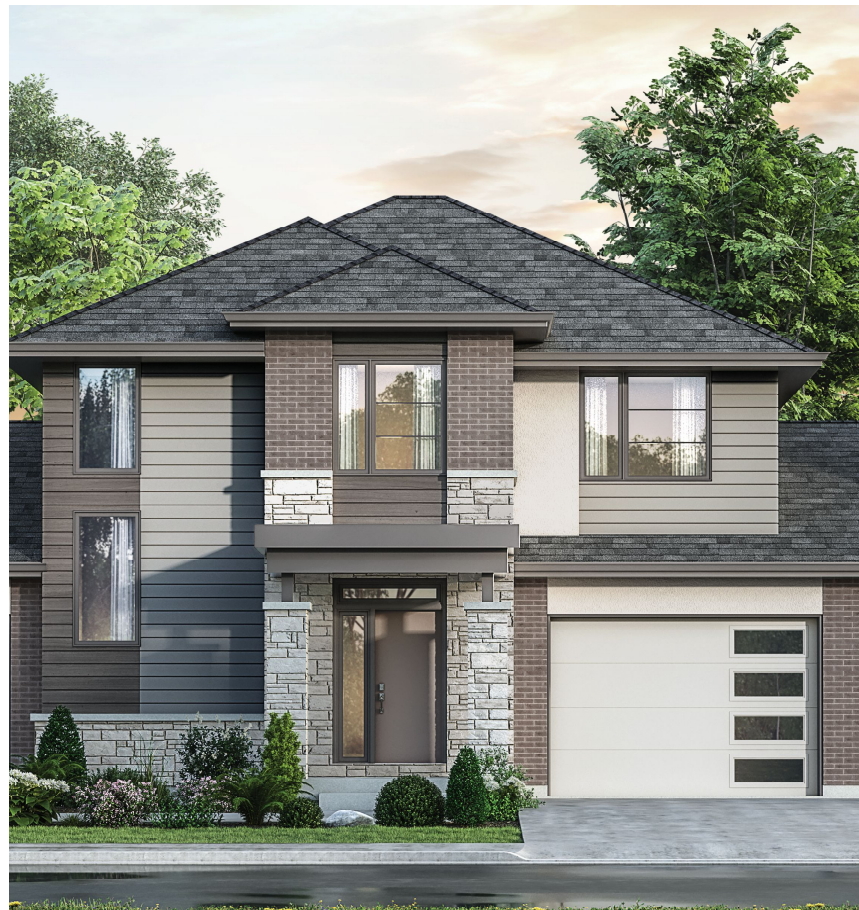
Architecturally Inspired Front Facade