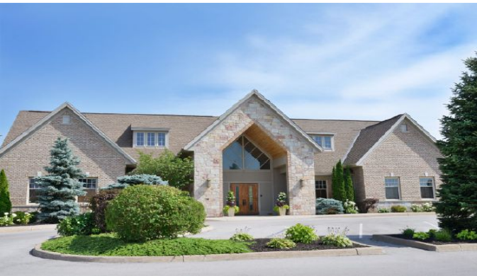
Access to the Hunter's Pointe Community Center