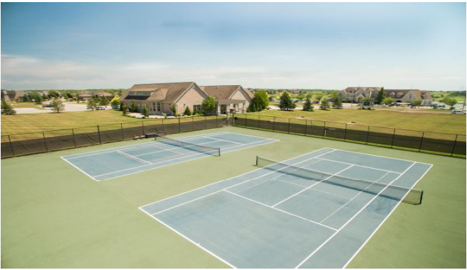
Challange your freinds over at the tennis/ pickleball courts