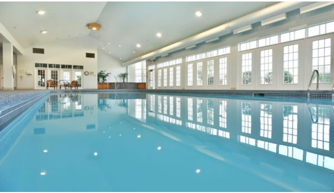
Take a dip in the pool or relax in the jacuzzi