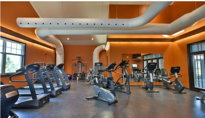
Use of the communiuty gym

The Community Centre is open from 5:00am to 1:00am, 7 days a week and acces-sible by security key card system.